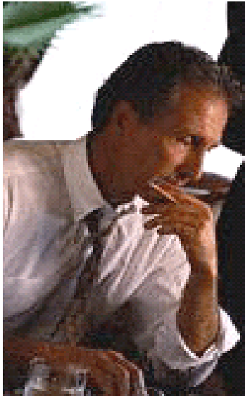
Remove the Uncertainty